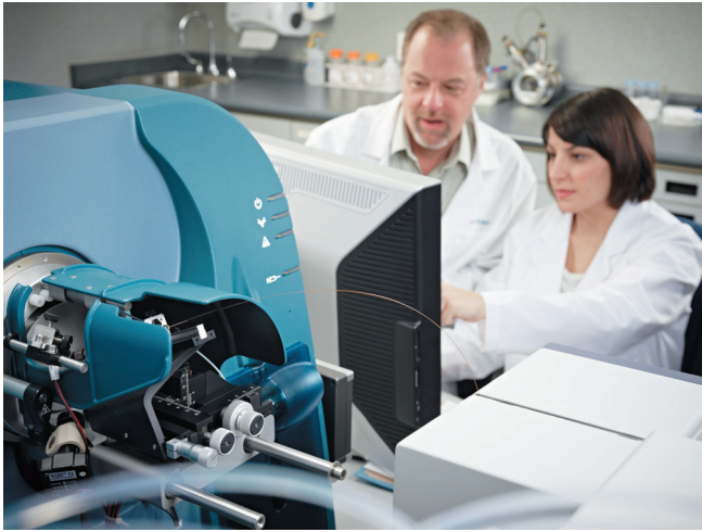
The implementation of ENOVIA's MCC product gives senior management confidence that a process is now in place to mitigate RoHS and REACH noncompliance risk.