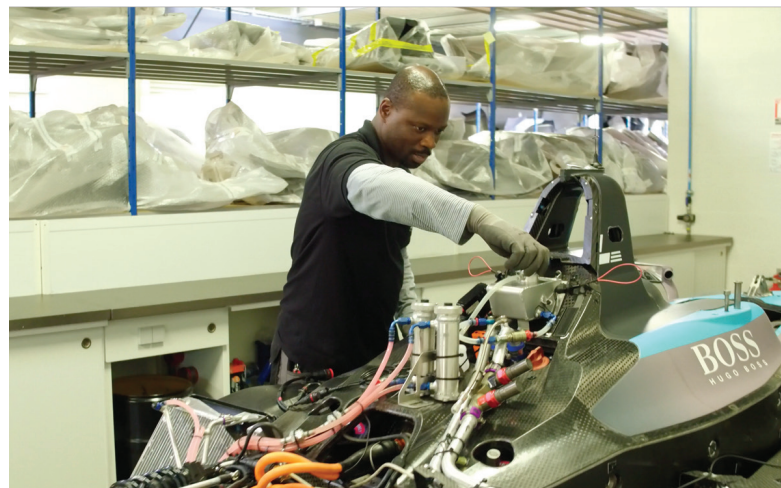
Top image: Spark Racing Technology uses Dassault Systèmes' 3DEXPERIENCE platform to digitally design and assemble the Formula E car components thanks the robustness of the platform and the collaboration model it enables.