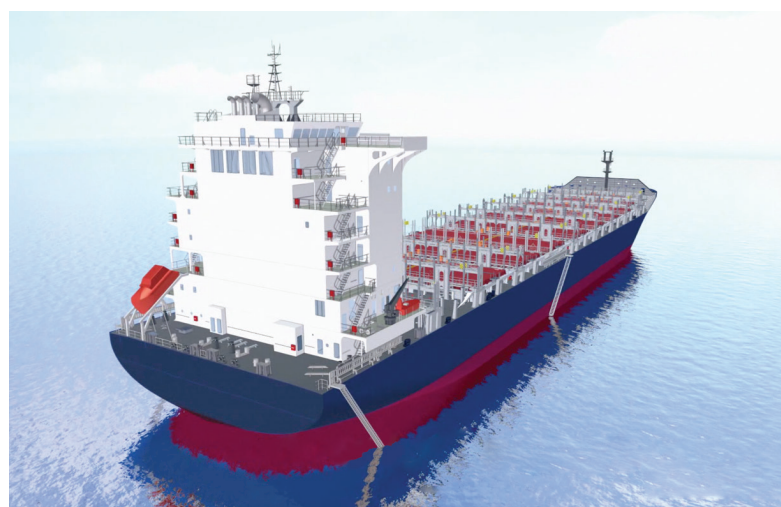
Top image: 3D Design and project management within the 3DEXPERIENCE platform