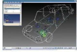
3D Harness installation