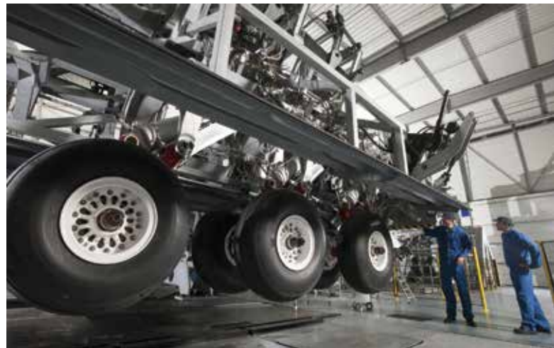
Top image: Messier-Bugatti-Dowty designers use CATIA application based on the 3DEXPERIENCE platform to model their customer's landing gear.