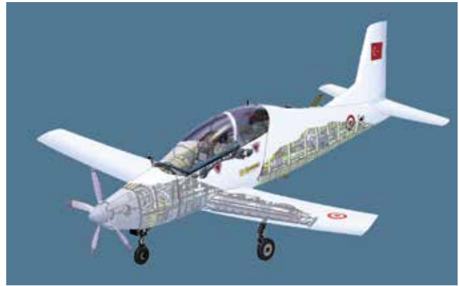
Training aircraft Hürküş TAI

Reutimann said. "This is where our creative consultancy really starts. In our proposals we cover various aspects of a transparency - the thickness and composition of the shield, whether it should be heated or not and its installation in the aircraft. Reutimann and his team use CATIA and DELMIA, both part of the 3DEXPERIENCE Platform. Based on this Platform all Mecaplex proposals are validated including characteristics such as openings, screwed and bonded joints, as well as the tools and NC programs needed for production. The milling of the transparencies is a delicate process starting with the programming and extending through the clamping stage all the way to the actual machining. To ensure this Mecaplex programs and controls their modern three-axis and five-axes milling machines for mold design and construction. "I have always been an advocate of virtual product design," Reutimann admitted. "When I was a student, one of my college professors showed us the many possibilities CATIA offers for putting ideas into practice. At that time, we literally spent entire nights designing and to this day, I still enjoy working with this application." Now, Reutimann cannot even imagine doing his job without CATIA. "We are free to design any shape, even for the most complex parts such as indicator lamps or wing tips, which are subjected to extreme stress. We then complete the design by running analyses and manufacturing the parts. All in a day's work," he added.