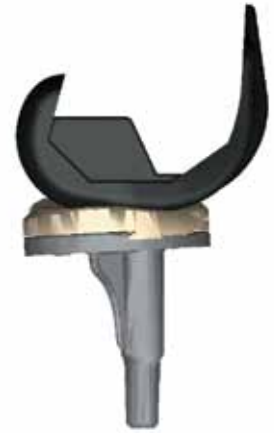
(Top) Numerical model of a Total Knee Arthroplasty

The ultimate aim of total knee replacement is to have a prosthesis that behaves as naturally as possible. "Abaqus is helping us get ever-closer to designs that let TKA patients do everything they want to for a full, active life after surgery."