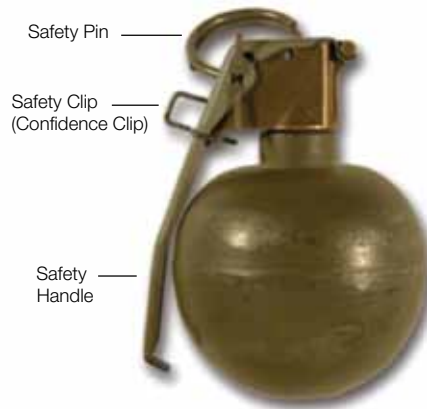
Figure 1. M67 hand grenade

ARDEC engineers were already using Abaqus to model design behavior, since many of their loading scenarios involve highly dynamic, transient events. As such, ARDEC engineers are well versed in the use of Abaqus/Explicit, SIMULIA's best-in-class transient simulation software. However, XFEM works only in Abaqus/Standard, so for