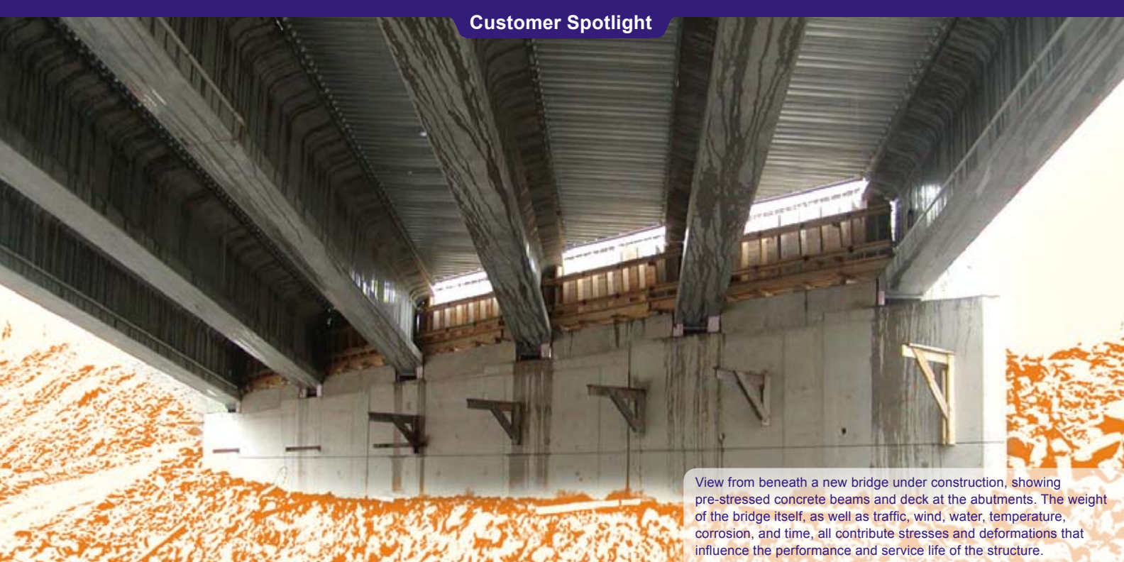
View from beneath a new bridge under construction, showing pre-stressed concrete beams and deck at the abutments. The weight of the bridge itself, as well as traffic, wind, water, temperature, corrosion, and time, all contribute stresses and deformations that influence the performance and service life of the structure.