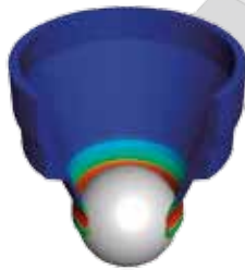
Figure 2. FEA of extrudable ball seat.