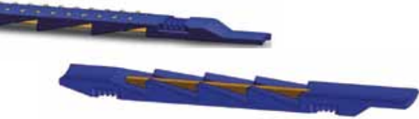
Figure 1. Reinforced anchor slip.