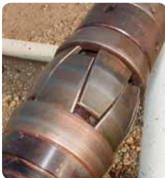
Segmented expansion cone.