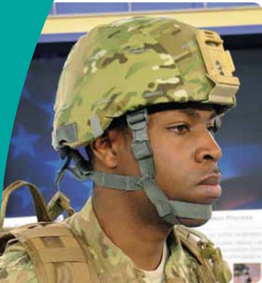
Figure 1. The U.S. Army's Advanced Combat Helmet (ACH).

MIT Man-Vehicle Laboratory uses Abaqus to explore and improve helmet liner design to prevent traumatic brain injury caused by blast events