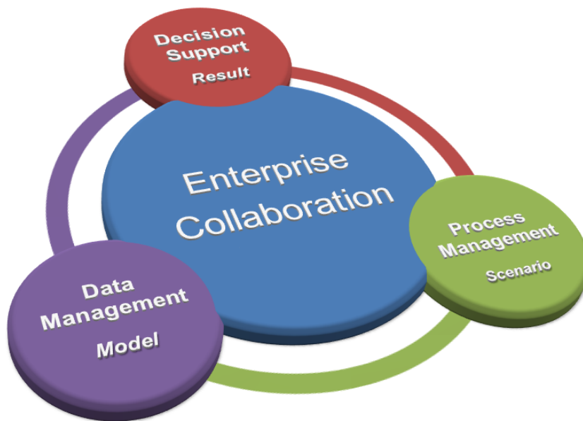
Figure 2—Four Components of SLM

Simulation data management is similar functionally to PDM but designed specifically for S&A needs. It enables users to more easily and quickly find the simulation information they need. They can query for simulation inputs and results and the status of simulation