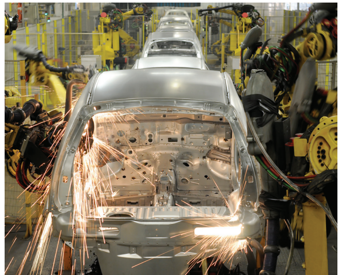
Consistent execution of best practice quality processes

DELMIA's Lean Quality Improvement solution provides Enterprise Quality Management Software (EQMS) and the ability to best manage and continuously improve product and process quality in a global manufacturing environment. A single, unified manufacturing process framework and data model unifies and standardizes quality management across the enterprise. Key capabilities include: quality planning and enforcement, defect containment, quality reporting, and analytics for multi-site operations.