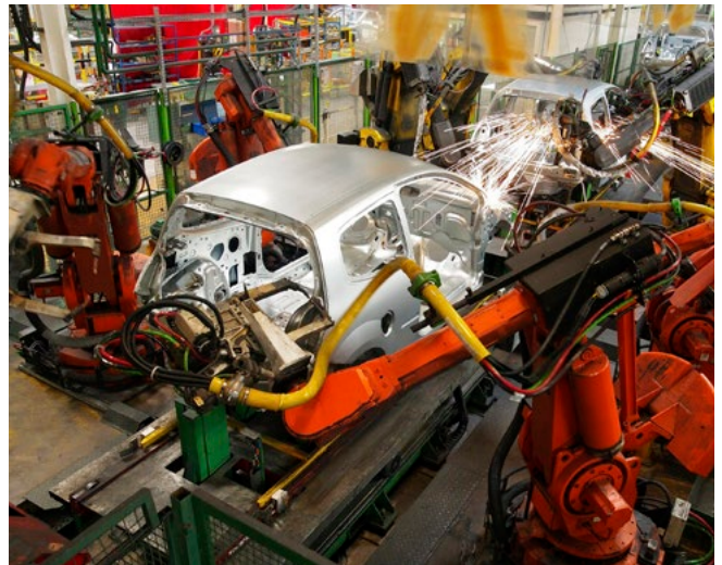
Global production execution solution

DELMIA's Lean Production Execution solution's ability to manage and synchronize distributed global operations helps to standardize and share best practices across sites while accommodating multiple manufacturing models. It easily adapts to different manufacturing environments – simple or complex, small or large, high or low volume. As an enterprise solution, manufacturers are enabled to define, control and optimize operations across multiple sites and functions, while still accommodating site-specific extensions.