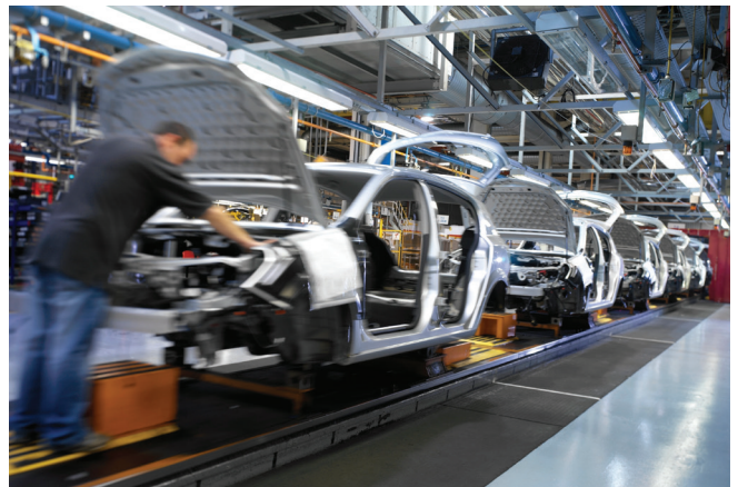
Graphic-rich visualization of operations performance

DELMIA's Lean Performance Management solution provides a powerful, intuitive platform to improve visibility into manufacturing operations, both in and across plants, for quality decision making and alignment with business performance targets. Data is mined from disparate system sources, normalized into information and rendered into contextualized intelligence for each plant across the enterprise. Increased visibility into global manufacturing operations helps to improve performance across plants, including: New Product Introduction programs, non-conformance identification and resolution, and the implementation of best practices.