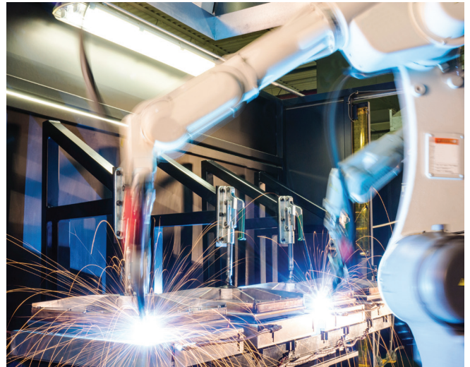
Manage across global operations using consistent KPIs

DELMIA's Learn Anywhere, Improve Everywhere solution improves visibility and control of manufacturing operations, both in and across plants, to improve decision making and alignment with business performance targets. Information is made available quickly, with sufficient granularity and context to empower managers to make better decisions, faster. Able to mine data from disparate system sources and normalize into information, it renders contextualized intelligence to shop floor workers, managers and executives across the global operations organization.