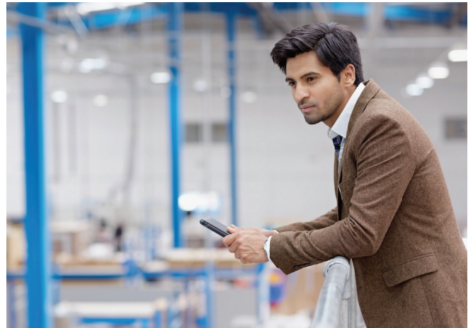
Visibility and control of material supply and logistics execution operations

DELMIA's Clear to Build solution delivers the ability to achieve highly responsive, adaptive manufacturing and logistics execution by synchronizing raw materials, components and semi-finished goods with production, quality inspection and material management processes. As an enterprise solution, manufacturers can define, control, and optimize operations across multiple manufacturing and warehouse sites and functions, while still accommodating specific site-level requirements.