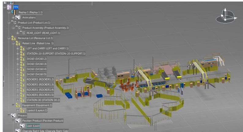
Leverage intellectual property across the extended enterprise at low cost