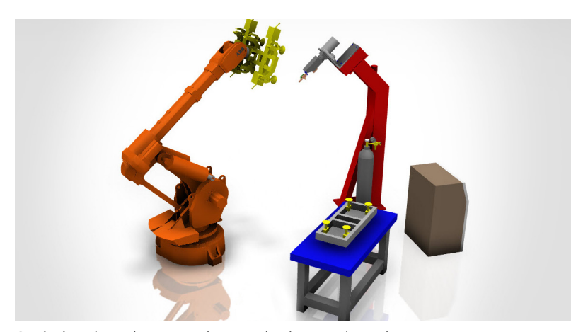
Optimize the robot's motion, cycle time and reach to create a collision-free path.