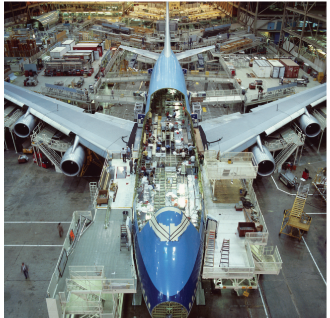
Provides global visibility into manufacturing operations

DELMIA's Aerospace & Defense Build Control delivers a suite of proven and scalable business process modeling, global process management and production intelligence solutions that enables OEM's, Tier 1 and Tier 2 suppliers to have a Manufacturing Operation Control Center. Companies can increase manufacturing efficiency by leveraging real-time KPIs and analytics of production orders, quality issues, inventory flows, equipment effectiveness and labor utilization across the extended enterprise.