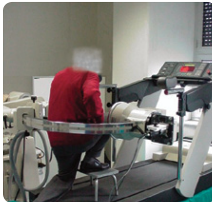
Post-surgery patient undergoing videofluoroscopic analysis of the function of their replacement knee.

But since the physiological range of motion of a ‘normal’ knee is a wider zero to 135 degrees, some TKA patients find they can’t return to their previous levels of full functionality or activity. Some people’s bones show an atypical response to implantation of the metal, even though it is biocompatible. And as lifespans get longer, the durability of implants becomes increasingly more important. To drive research and innovation and achieve a greater understanding of knee kinematics, improved mobility and device robustness for knee patients, Smith & Nephew, the U.K.’s largest medical technology company, founded the European Centre for Knee Research in Leuven, Belgium in 2007.