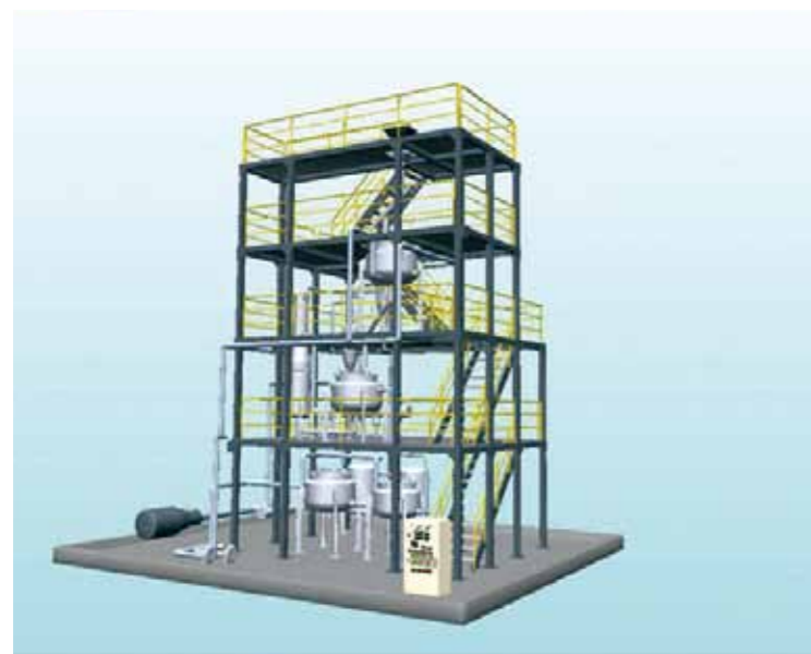
i-manual view of a plant system

Japan's Taira Promote Co., Ltd. specializes in the creation of technical media including training, instruction manuals, and presentation materials. Taira Promote was founded in 1964 and has since grown to a 103-employee company that creates online visual manuals to provide users with greater learning efficiency thanks to their interactivity and visual appeal.