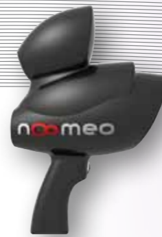
OptiNum scanner - original version

This new solution will help Noomeo democratize the use of the 3D scanner, previously reserved for large industrial groups. Its target markets are industry in general (reverse engineering and design, digital modelling), the mechanical sector (CAD, prototyping), the paramedical sector (cosmetic surgery, prosthetics, health care traceability) or the heritage sector (virtual museums, digital archiving).