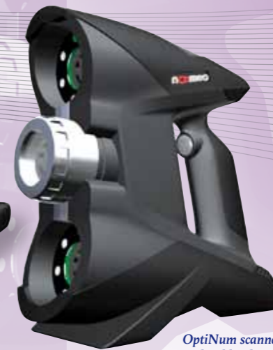
OptiNum scanner - new design realized by the Design Studio