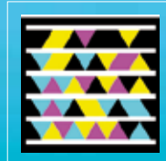
Use your smartphone to learn more about the Minesto

Minesto uses CATIA to design innovative tidal energy solutions. The flexibility and rapidity with which it can create its designs enables Minesto to show potential customers design variations based on their requirements. Compared to its previous CAD system, model size is no longer a problem, allowing Minesto to work on complex models and assemblies of its products.