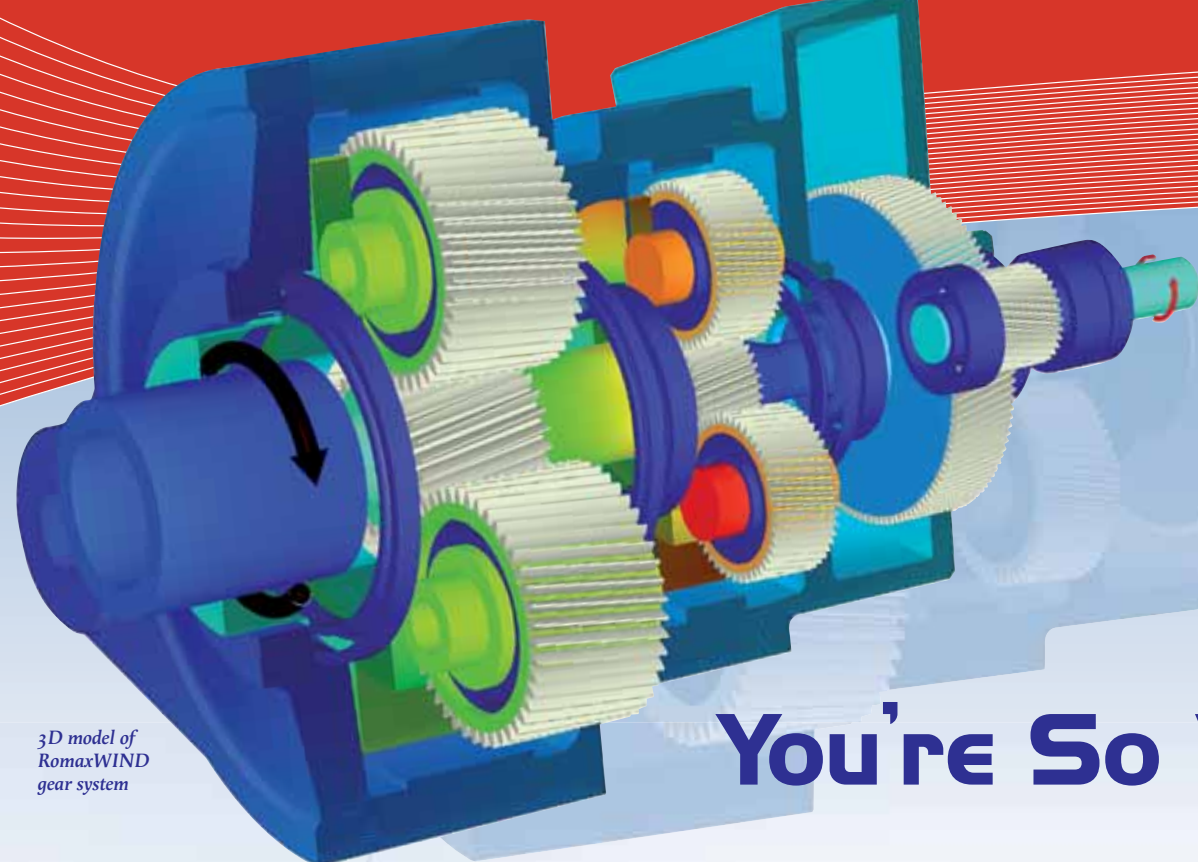
3D model of RomaxWIND gear system