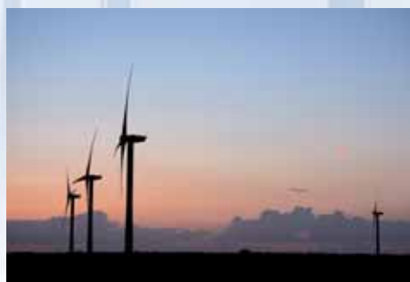
Wind turbines delivering clean energy

For more information: www.romaxwind.com www.appliedgroup.com