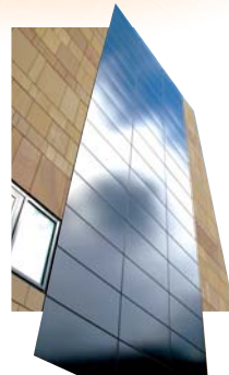
ENOVIA SmarTeam supports Innovation at Solar Century

For more information: www.solarcentury.com www.designrule.co.uk