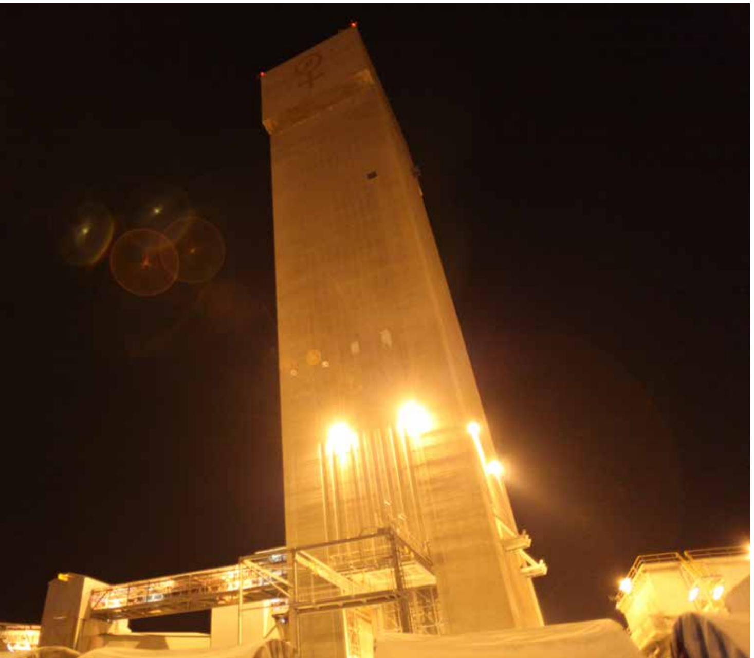
The shaft head gear at Palabora's Mine Site.

BLOCK CAVE OPERATION ACHIEVES PLAN AND PRODUCES 60,000 ANNUAL TONNES