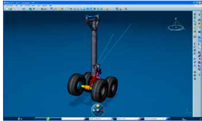
Powerful stress and vibration analysis can be performed on a complex landing gear assembly that includes surfaces, solids, and wireframe geometries.