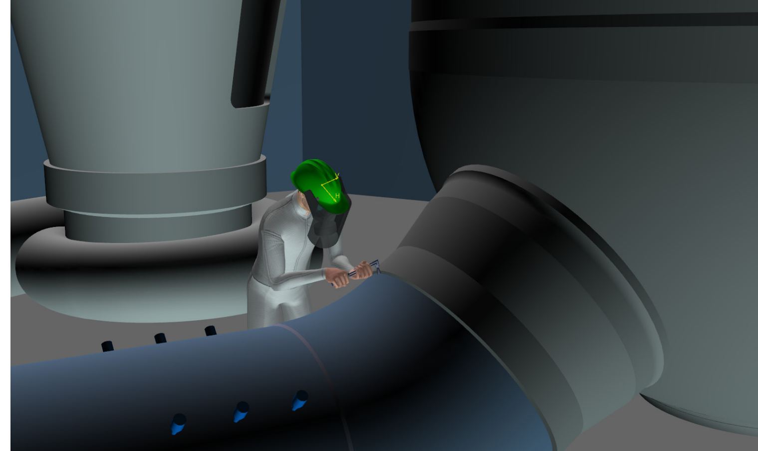
Simulate Human tasks and validate against ergonomic requirements.