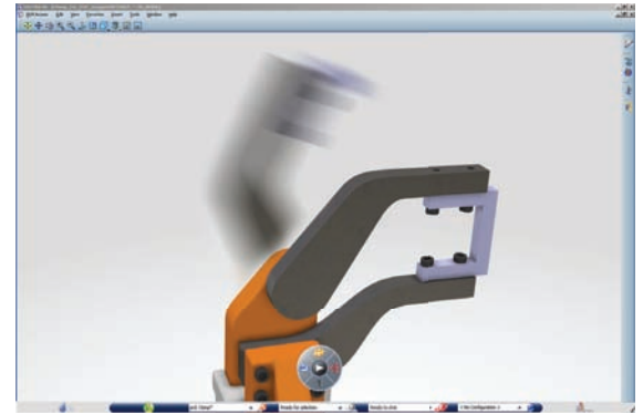
DELMIA Device Task Definition delivers the capability to program and simulate forward kinematic mechanical devices.