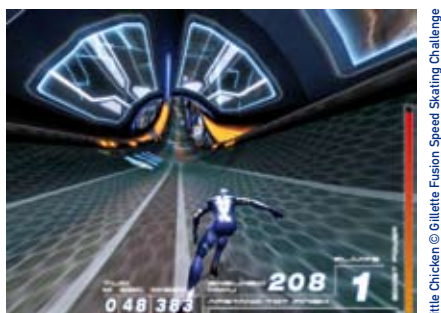
Little Chicken © Gillette Fusion Speed Skating Challenge