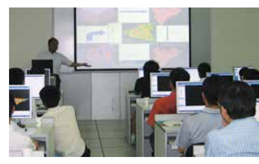
Educators play a critical role in developing the leaders of tomorrow.