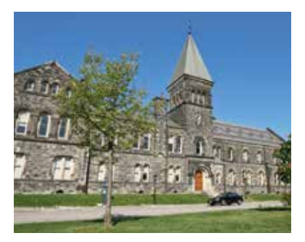
More than 100 educational institutions partner with Dassault Systèmes GEOVIA.

The License Administrator plays a key role as the liaison between the educational institution and Dassault Systèmes GEOVIA, acting as a single point of contact with GEOVIA's Services and Support teams, and auditor of the usage of software licenses. To ensure your institution and its students get the most value out of GEOVIA's software, all new License Administrators must take five days of paid training from GEOVIA at the start of the first year of Program participation. One day of additional training completed at a GEOVIA facility, on-site or online, is required each year thereafter for existing License Administrators. Additional fees for staff time and travel expenses will apply.