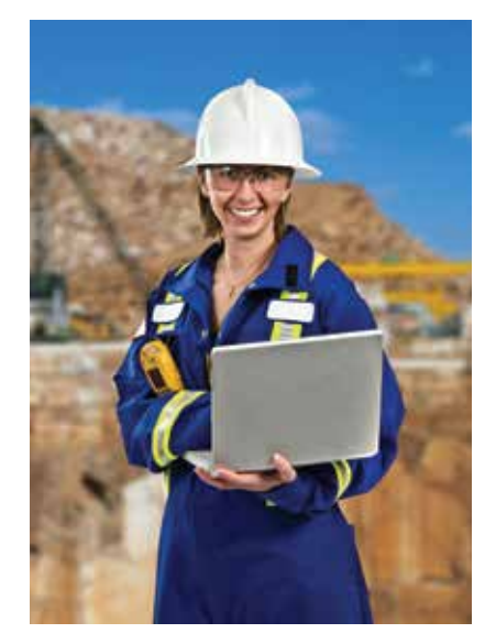
Provide the software skills your students need for their future jobs.

**Maintenance and Support provides regular upgrades to the software. Technical Support is limited to the designated License Administrator.