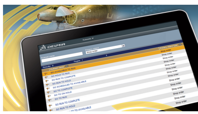
Rule set portal is used to configure customer driven business rules.

DELMIA Velocity Core includes AIS – the DELMIA Operations Advanced Integration Services layer. AIS is a highly flexible tool for streamlining information flow. Its XML-based, service-oriented architecture is built to enable easy integration of the DELMIA Operations Suite with complementary applications. It can accept upstream data from Engineering, for example, or output data to a downstream ERP suite.