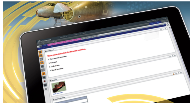
3D views change as the user navigates from task to task.

DELMIA Operations Execution guides data collection and speeds and automates the determination of an optional workflow. Non-conformance reports, corrective action requests, planning change requests and other anomalies trigger a data-based process that lets managers modify or create shop orders to resolve the problem.