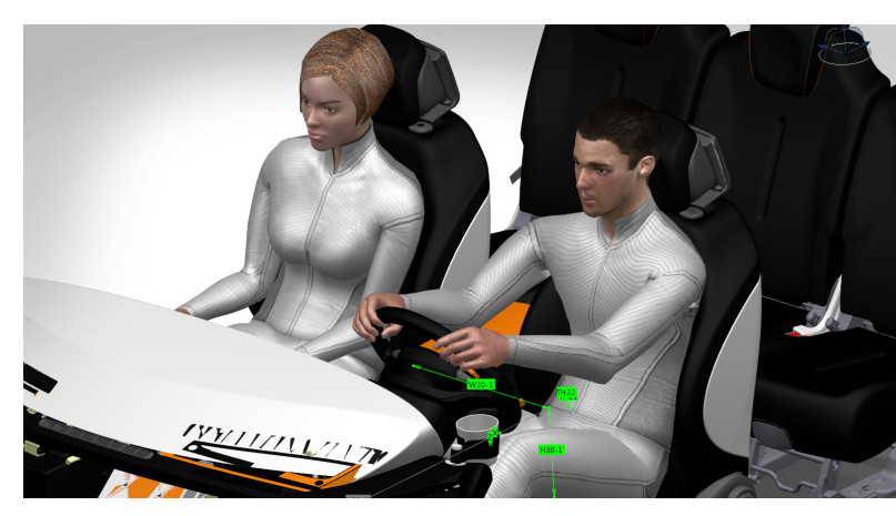
Discover posture and comfort issues early in the design process.