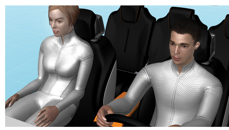
Derive a posture prediction based on precise anthropometry.