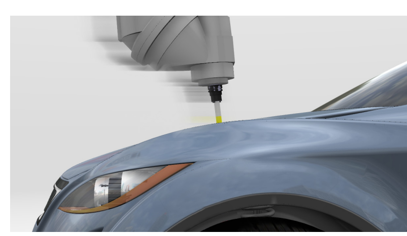
DELMIA Milling Machining offers a full set of high-end strategies such as roughing, advanced finishing, Z-Level, pencil, contour-driven and curve machining that sculptures any complex surfaces.