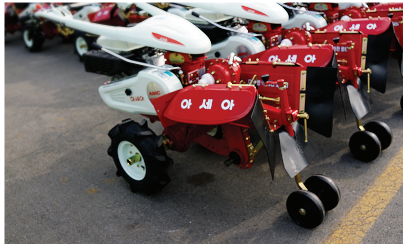
Above: Agricultural machine visualized with 3DVIA Composer