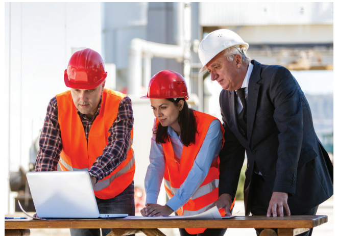
Compress the construction schedule

DELMIA's Optimized Site Execution solution provides visibility to all stakeholders on project status, in real time, for effective decision making. Access to accurate and up-to-date information helps minimize the waste of time, cost, and resources with executable and reasonable plans. From engineering deliverables to procurement and field execution, stakeholders can analyze change impact in real time and synchronize schedules between material flow and team activities.