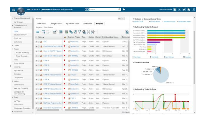
Figure 2 High Level view of all ongoing Projects