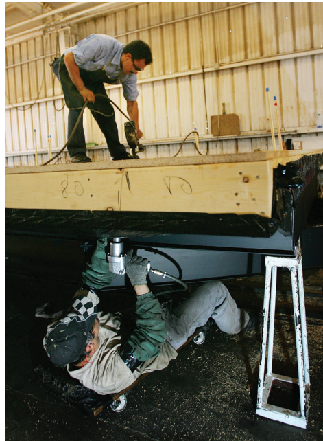
Workers build a floor on a chassis at a factory.

Forward-thinking suppliers and subcontractors already are promoting this new method of project delivery. As more building owners buy into the benefits of prefabrication, more members of the construction industry may find themselves adapting to this new reality.