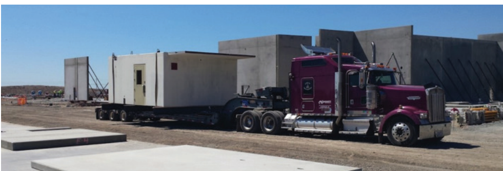
Modular construction at the Corrections Corporation of America's detention facility in Otay Mesa, California

Meanwhile, many international contractors are looking to their European or Asian counterparts for ideas.