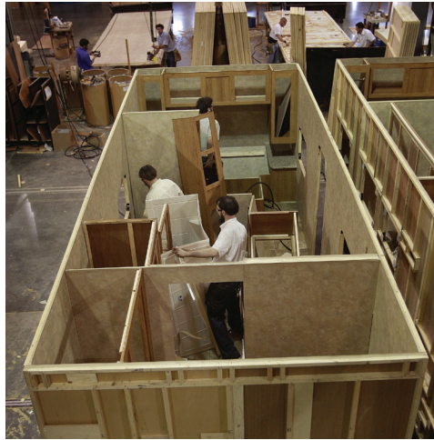
Workers construct a modular structure in a manufacturing facility.

Laborers working in a controlled factory environment don't have to brave jobsite hazards such as ice or winter chills, unsafe access to electricity, or dangerous heights. A factory-controlled environment also makes it possible to supply components and equipment where the worker needs it, rather than having workers moving parts through an active jobsite.