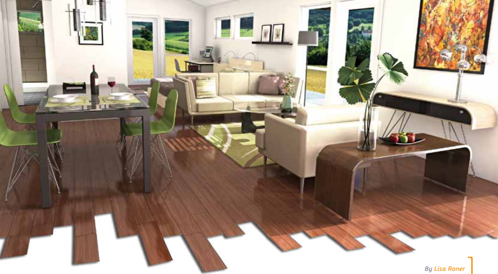
Photorealistic image of the interior of an Element model home designed with CATIA Photo Studio Optimizer