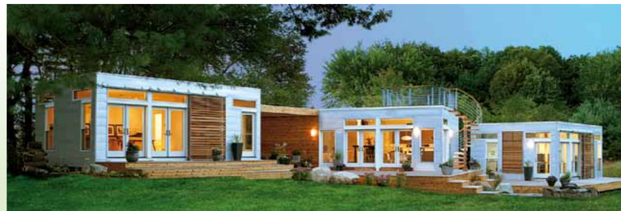
The modular design of Blu Homes allows for substantial creativity. In this photograph, three Origin models were combined to create a distinctive home addition.