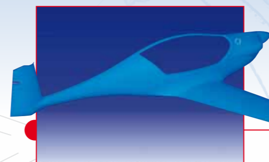
Pipistrel's aircraft designed with CATIA PLM Express