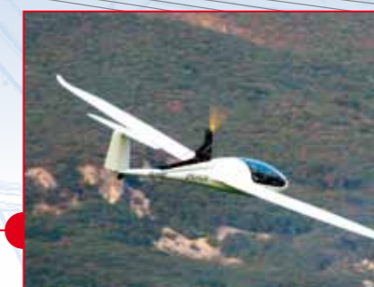
Lightweight eco-friendly aircraft flying